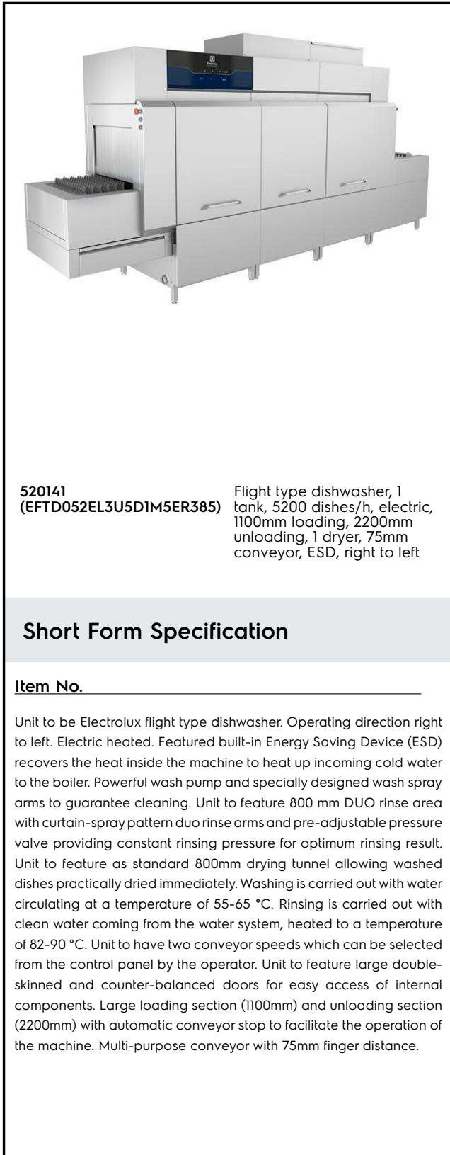
520141 (EFTD052EL3U5DIM5ER385) Flight type dishwasher, 1 tank, 5200 dishes/h, electric, 1100mm loading, 2200mm unloading, 1 dryer, 75mm conveyor, ESD, right to left